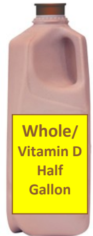
Whole/ Vitamin D Half Gallon

Children between the ages of 1-2 years can only buy WHOLE (Vitamin D) chocolate milk. The front label may specify whole or Vitamin D, or both.