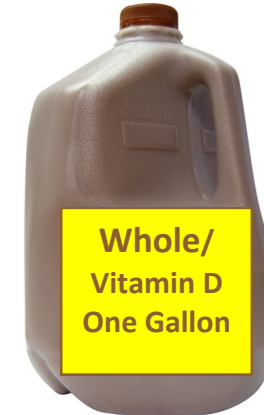
Whole/ Vitamin D One Gallon

To purchase "whole" (Vitamin D) chocolate milk, the word "Whole" must be written on the voucher.